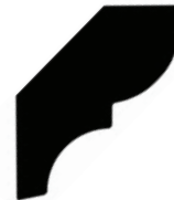
D75 - 8 ft 9/16" x 1-9/16"