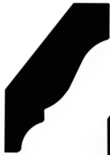
D52 - 16 ft 11/16" x 2-1/2"