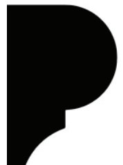
D154 - 16 ft 1-1/8" x 1-3/4"