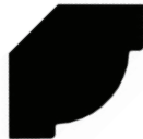
D31 - 8 ft 11/16" x 1-1/4"