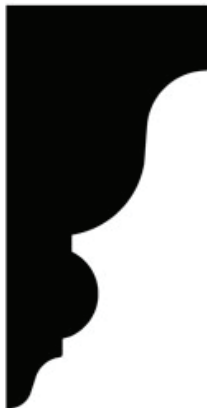
D794 - 16 ft 1-3/8" x 2-3/4"