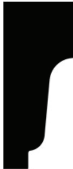
D211 - 8 ft 15/16" x 2-1/4"