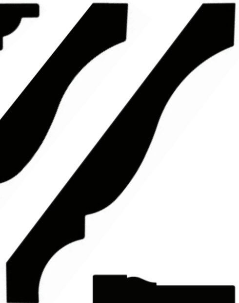
D45 - 16 ft 11/16" x 5-1/4"