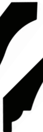
D80 - 16 ft 11/16" x 4-1/4"