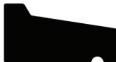
D197H - 8 ft 7/8" x 1-5/8"