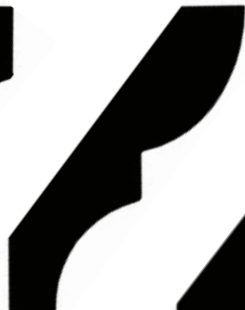
D70 - 16 ft 9/16" x 2-5/8"