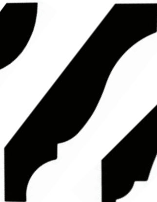
D49 - 16 ft 11/16" x 3-1/2"