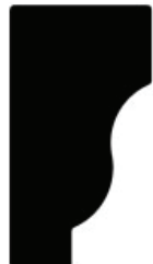
D210 - 8 ft 7/8" x 1-5/8"