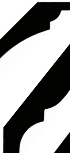
D47 - 16 ft 11/16" x 4-5/8"